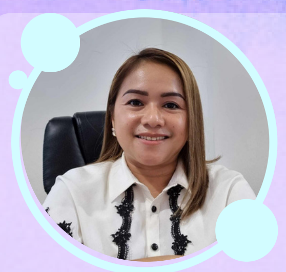
RTN RIO CONSIGNA