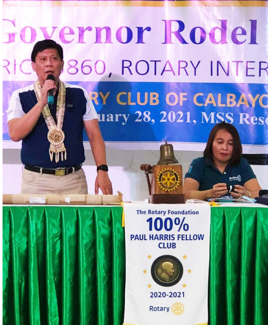
DG Riz, delivering an inspirational message

District Governor's Visit, February 28, 2021, MSS Resource Center, Calbayog City