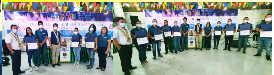
Awarding of New Paul Harris Fellows