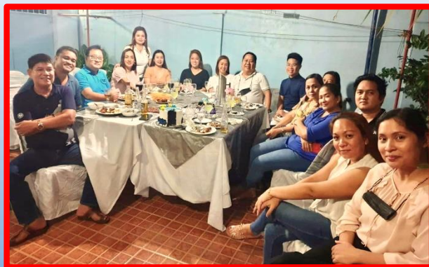
August 16 fellowship