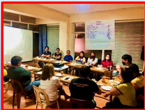
August 06 meeting

The main objective of the New Membership Orientation Session is for the new members to become more aware of their duties and responsibilities. Moreover, the discussion will help them to be more acquainted with each other along with the other members of the Club. It's an initial step to build a strong ties among the Club members and the newly inducted ones. With this, we are fervently hoping that the new members will become a lifetime Rotarians.