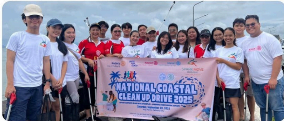
Rotary Club of Calbayog

This Rotary Youth Service Month, we celebrate the passion, leadership, and dedication of young people who are making a difference in their communities.