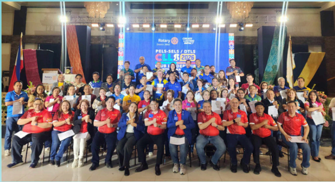
The 2026-2027 Club Presidents during the formal District 3860 MOU ceremony.