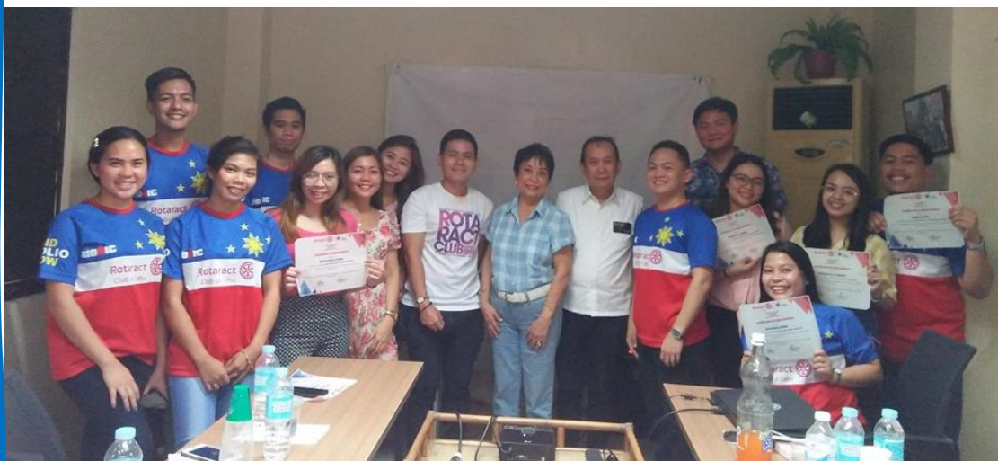
Tokens and certificates were rightfully given to guests and aspirants with gratitude after a successful BOS

expectations of the aspirants for the club. It was good to hear their reasons behind and expectations how they came about in joining the club and what they look forward to. It was pleasing to hear that almost all of them had service to others as their main goal on joining the club. Some of them have been also a servant in other organizations. As seniors and officers of the club, it's our duty to make sure that their expectations are met to the best of our ability and they would feel belongingness as a family to the club.