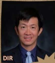
DIR ED TAN TING 22