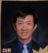
DIR ED TAN TING 22