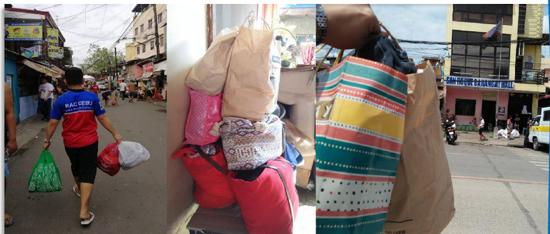
DAY 1, 2 AND 3 DONATIONS FROM ROTARACT CLUB OF CEBU AND FRIENDS.

If you want to donate to any of their basic needs, please hand it over to San Roque Brgy. Hall for equal & proper distribution to the fire victims. Your donation will be a great help to them. God Bless!