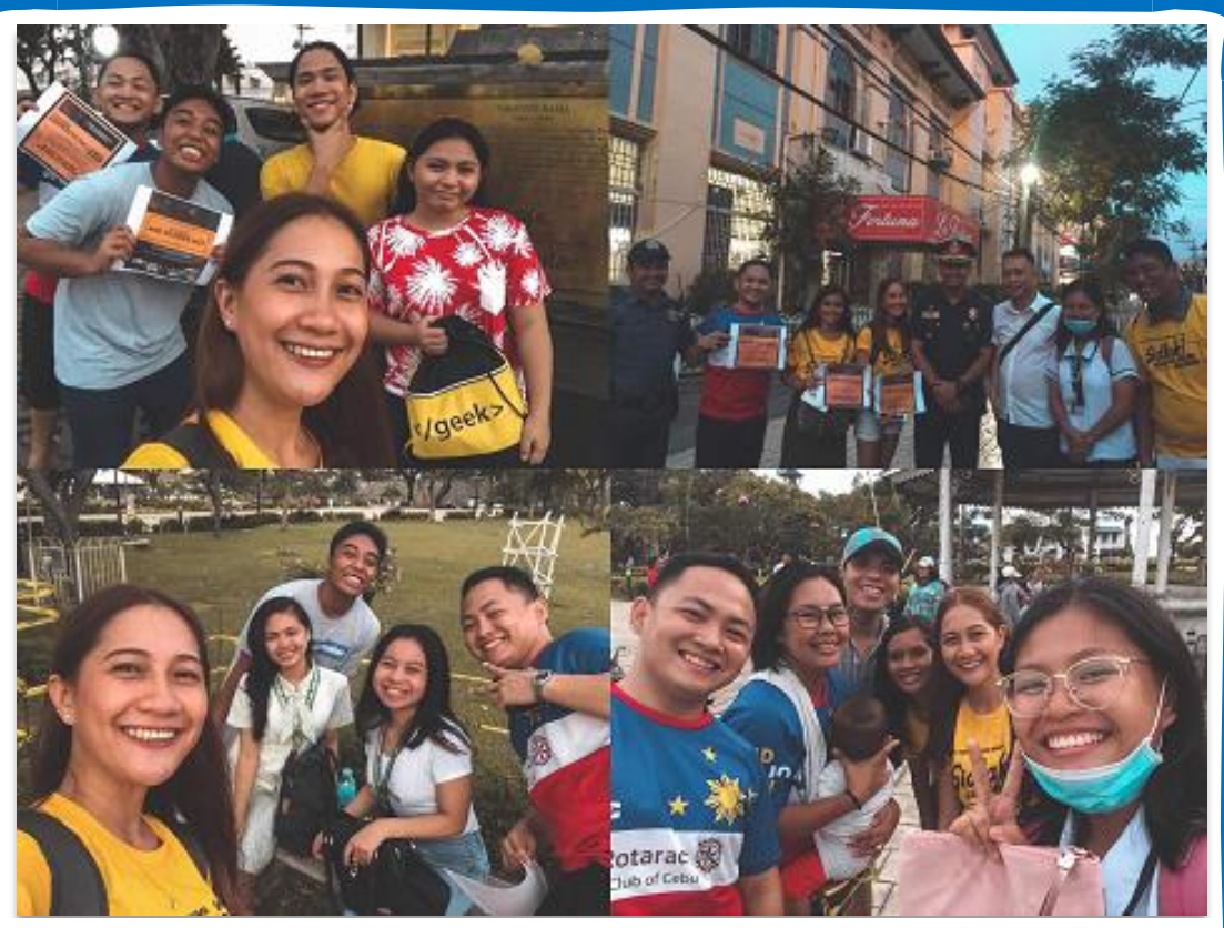
LAST MONDAY AT PLAZA INDEPENDENCIA AND CEBU CITY HALL GROUNDS, THE ROTARACT CLUB OF CEBU AND

Last Monday at Plaza Independencia and Cebu City Hall grounds, the Rotaract Club of Cebu and