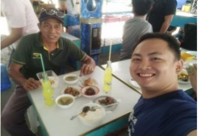
November 14, 2019 – Ride to End Polio Tarp Distribution to Oslob and Toledo

"paying a visit to your mother's club project is good, and sharing a smile to everyone who are involved in the project is better..."