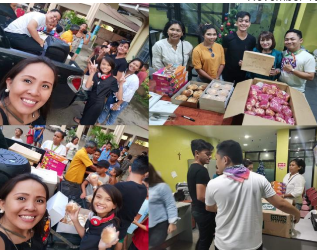
November 13, 2019 – Mobile Car Snacks Distribution

for him and served him by serving the visitors to his wake every night until the day of his burial.