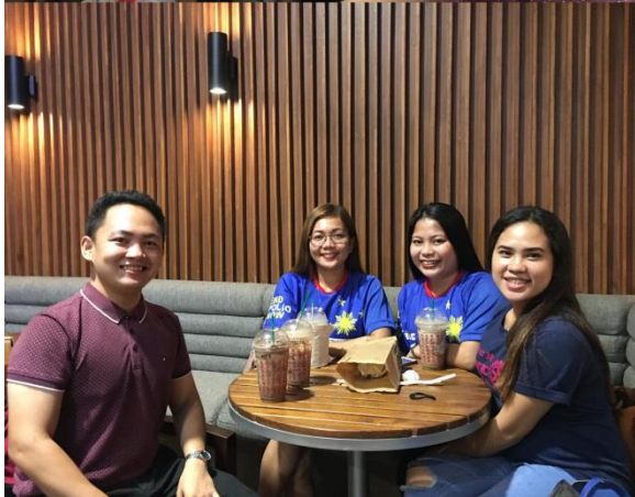
November 17, 2019 – Fellowship Dinner and Starbucks Chilling