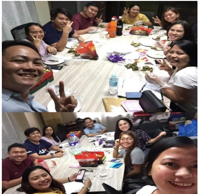
November 10, 2019 – Monthly Meeting in Rotary Office

Earlier in the morning of November 10, we already heard the sad news of the passing of