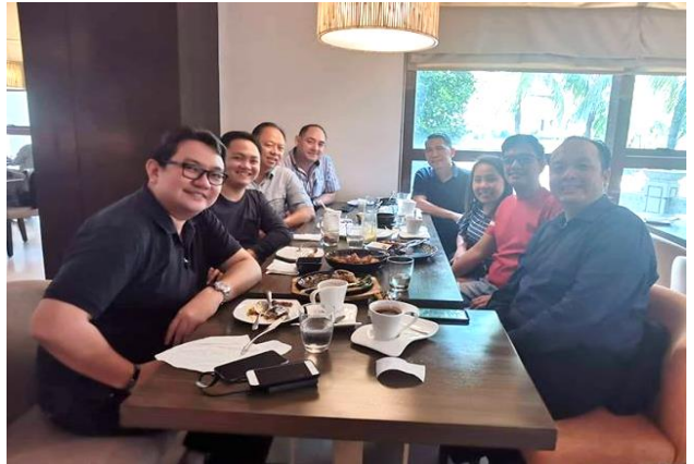
November 15, 2019 – Joint Meeting with Rotary Club of Cebu for its 87 th Anniversary

"paying a visit to your mother's club project is good, and sharing a smile to everyone who are involved in the project is better..."