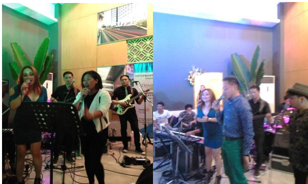
November 16, 2019 – Rotary Club of Cebu 87 th Anniversary

"real love stories never have endings... just like the bond and the service of Rotary Club of Cebu to humanity... on its 87th year..."