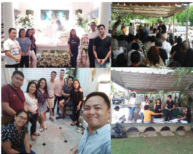
November 10 to 13, 2019 – 4-Day Service Tribute to Chiongbian

Earlier in the morning of November 10, we already heard