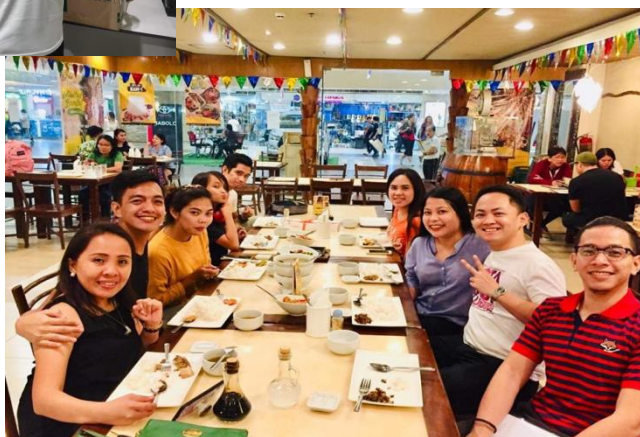
November 13, 2019 – Fellowship Dinner in SM