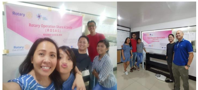
November 15, 2019 – RAC Cebu Supports project ROSAS