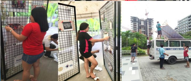
November 16, 2019 – Decorates the frame for the 87 th Anniversary

"throwbacking is nice but throwbacking while watching the photos is nicer..."