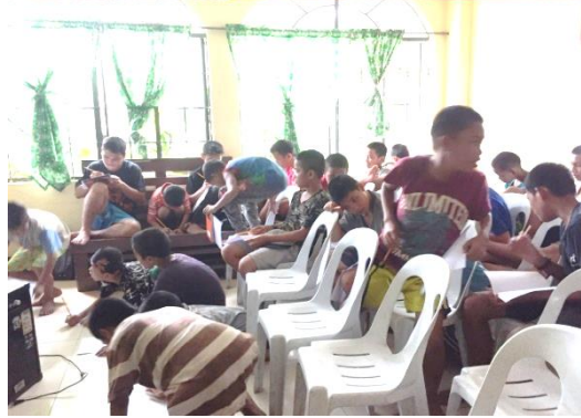
November 17, 2019 – absTEENence: Learning to say NO!

The Rotaract Club of Cebu in partnership with the Rotary Club of Cebu and Community Scouts Youth & Guidance Center conducted an "absTEENence: Learning