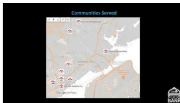
The Food Bank and Soup Kitchen Project