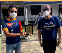
COMMODORE ERNESTO O BALDOVINO PN Commander, Naval Forces Central

Given this 2nd day of November 2021 during the celebration of Naval Forces Central 44th Founding Anniversary at Headquarters Naval Forces Central, Naval Base Rafael Ramos Brgy Looc, Lapu-Lapu City