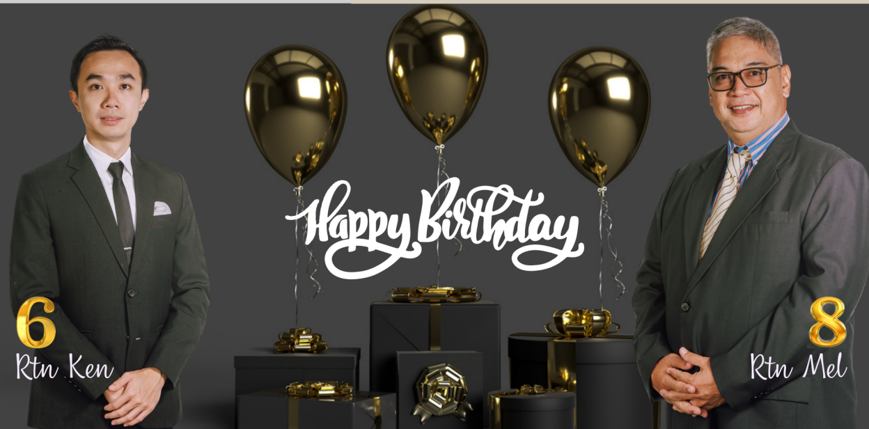
6 Rtn Ken