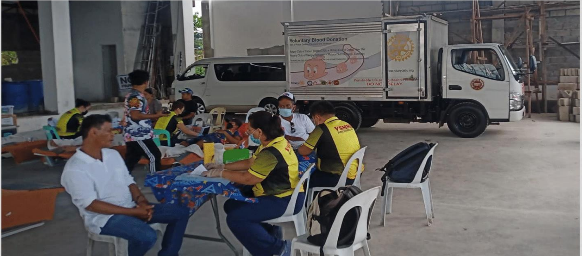
ROTARY DISTRICT 3700 AT THE MOBILE BLOOD DONATION IN MINGLANILLA. The van was donated by the district based in South Korea six years ago through the Rotary Club of Cebu. And until today, it adds more years, more lives, more smiles in more communities in Cebu.