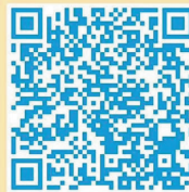
ICOC Membership Info Packet