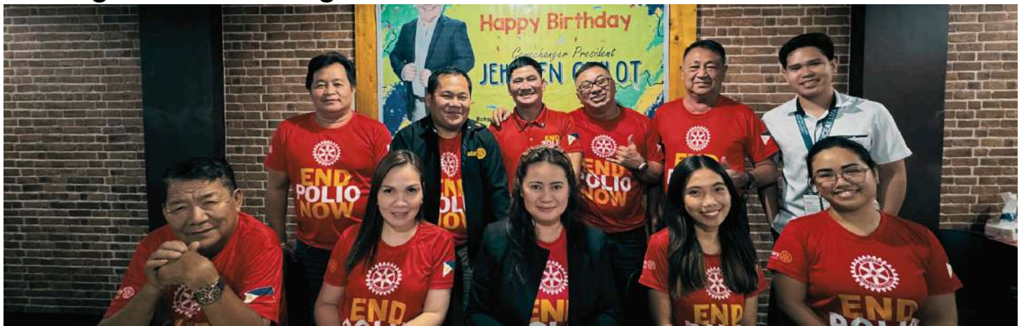
6th Regular Club Meeting