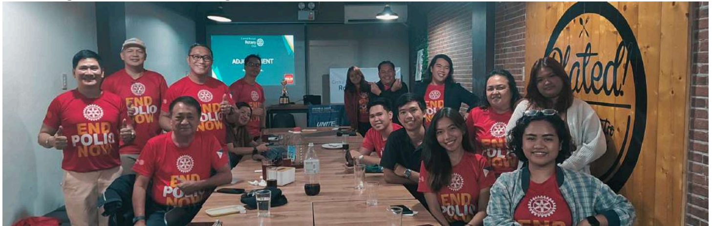
5th Regular Club Meeting