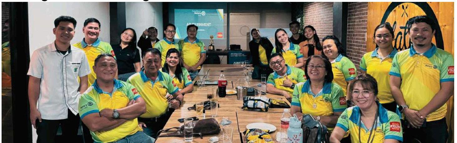
7th Regular Club Meeting