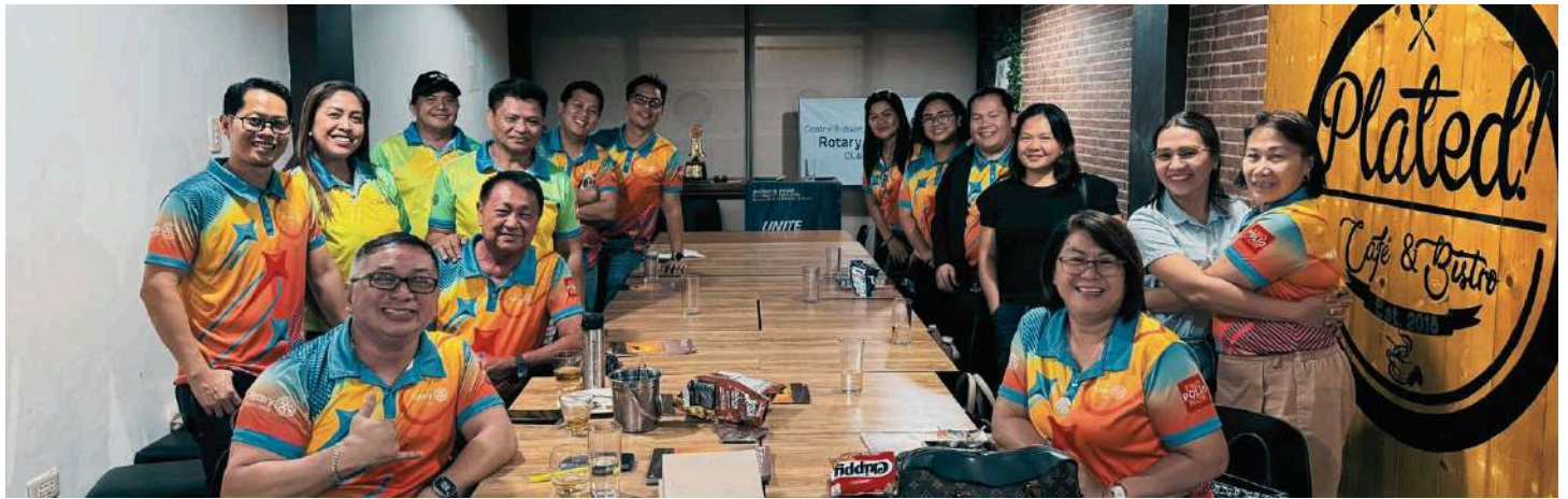
4th Regular Club Meeting