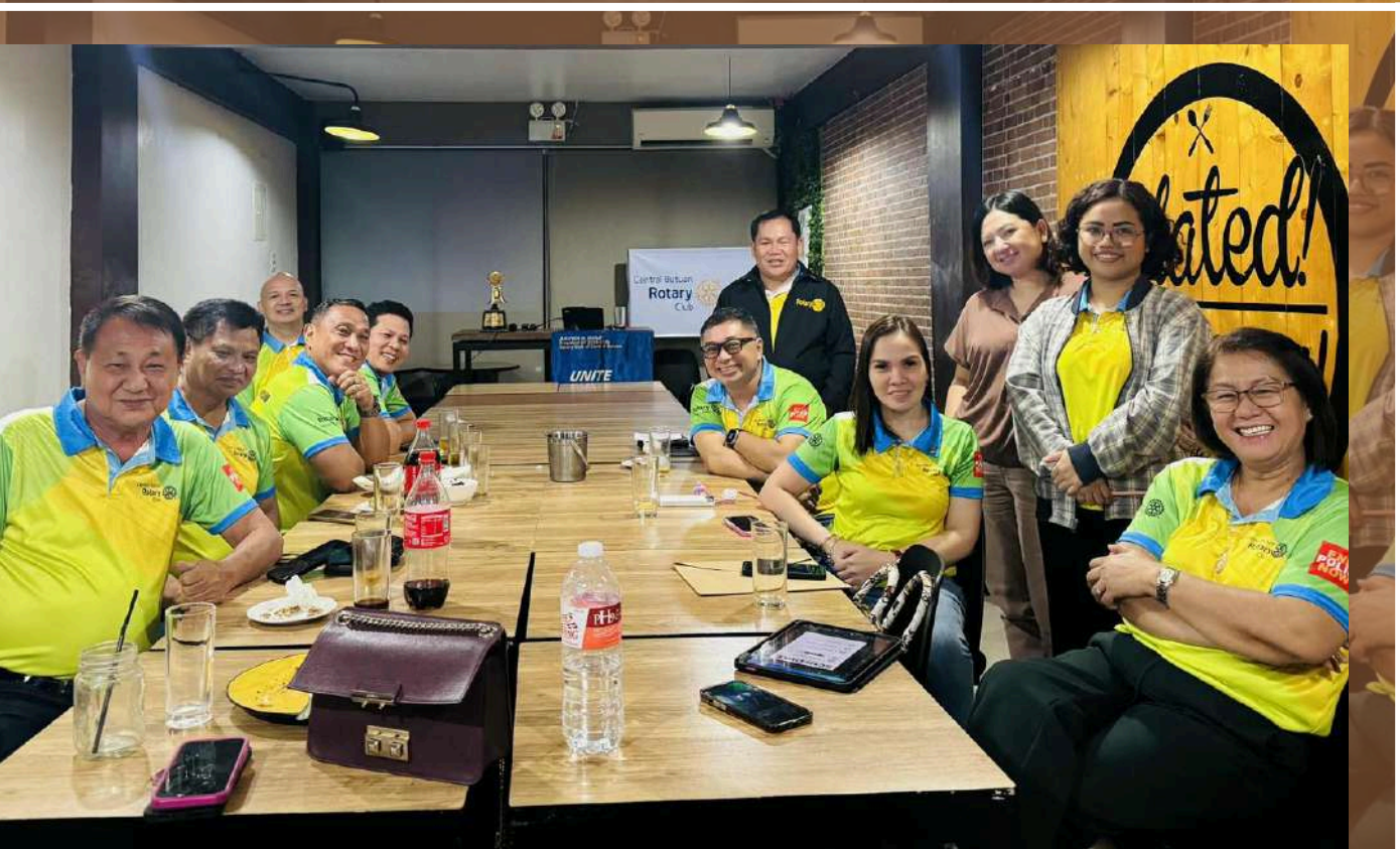
9th Regular Club Meeting