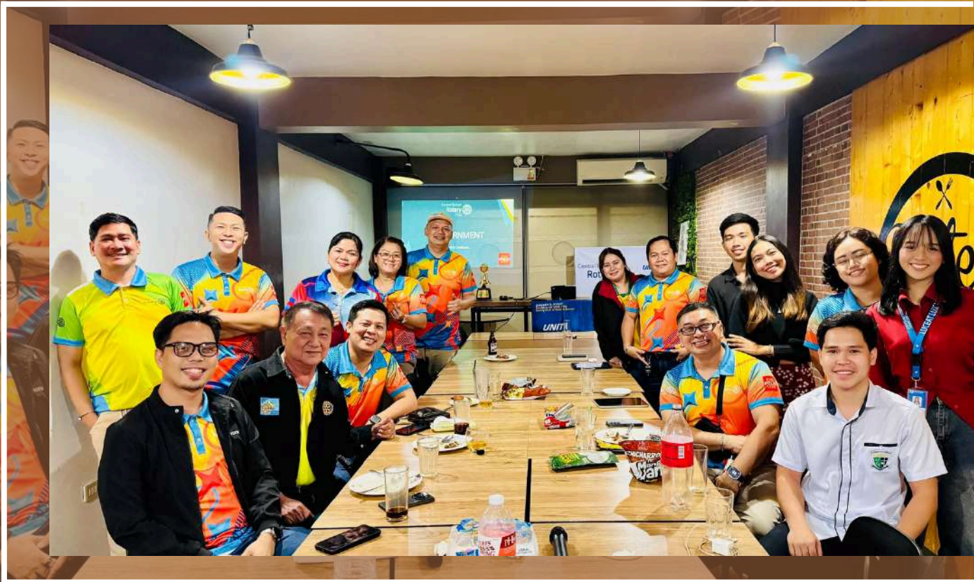
8th Regular Club Meeting