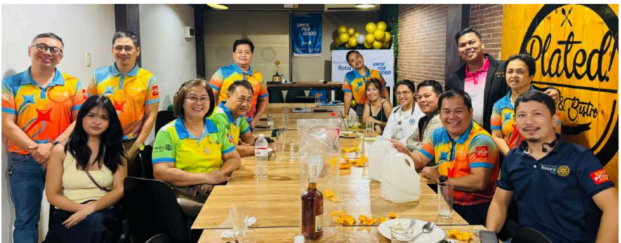
25th Regular Meeting | May 22, 2026