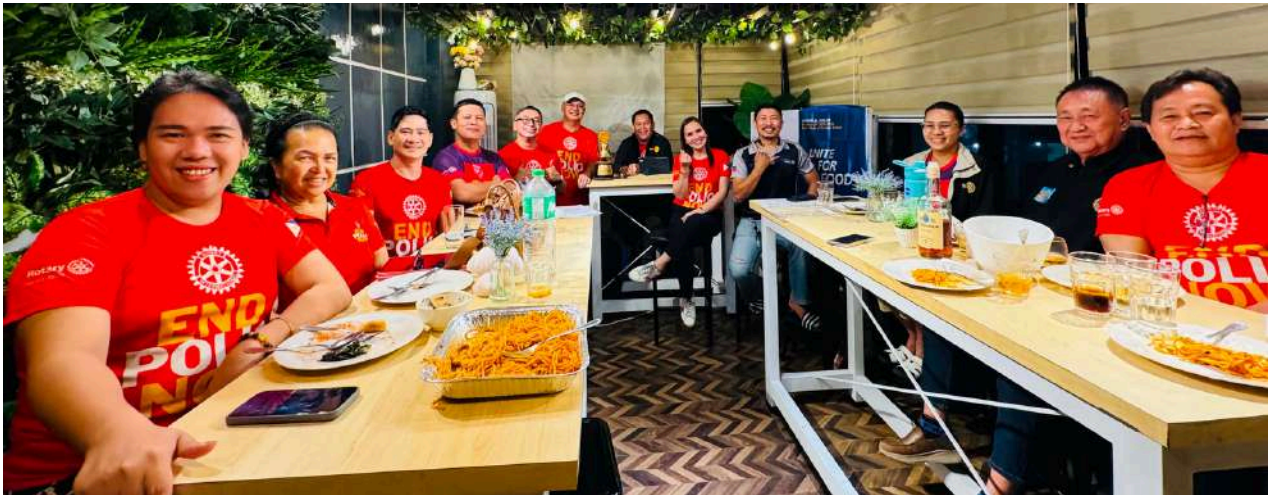
24th Regular Meeting | May 8, 2026