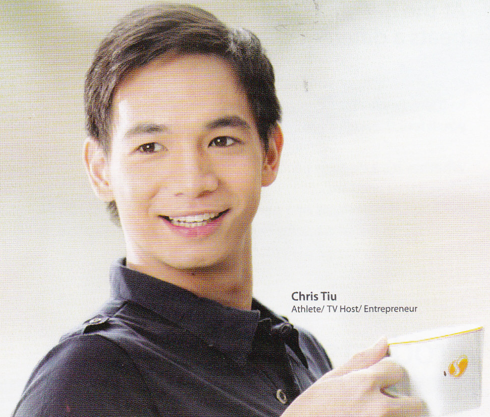
Chris Tiu Athlete/ TV Host/ Entrepreneur