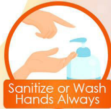
Sanitize or Wash Hands Always