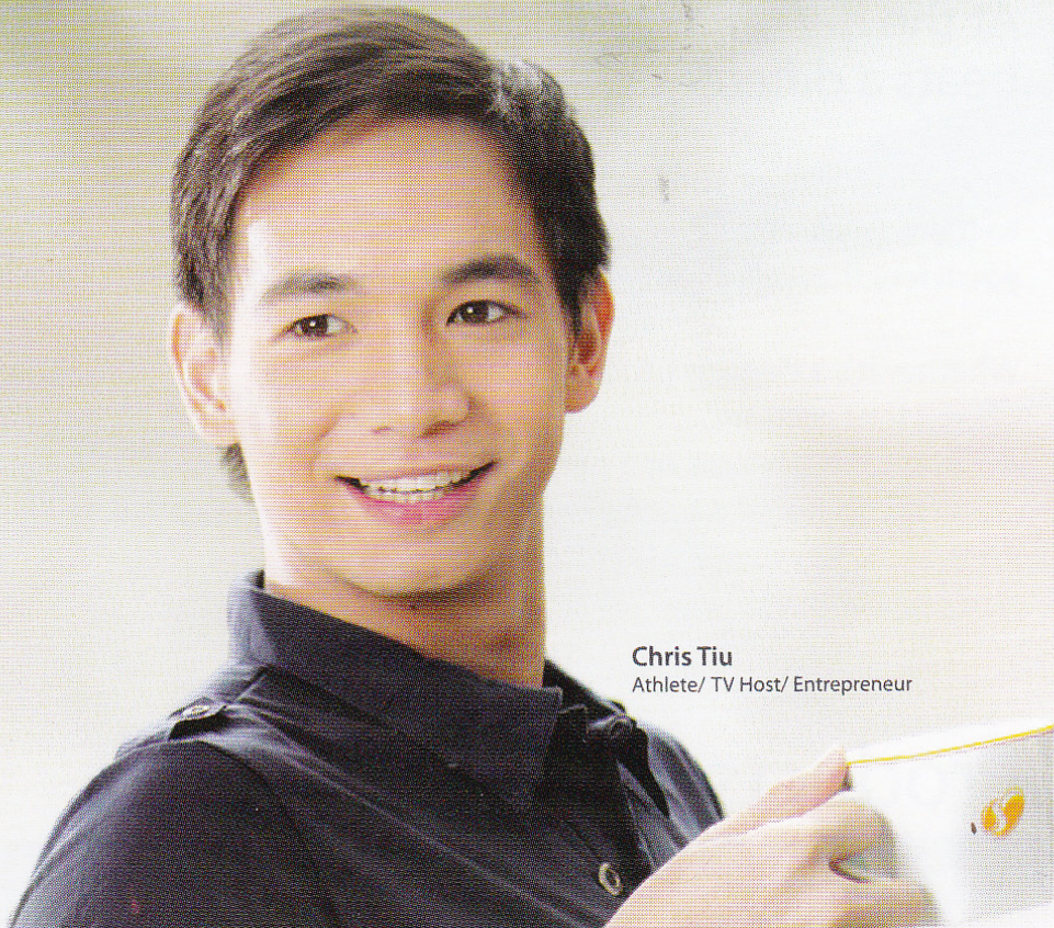
Chris Tiu Athlete/ TV Host/ Entrepreneur