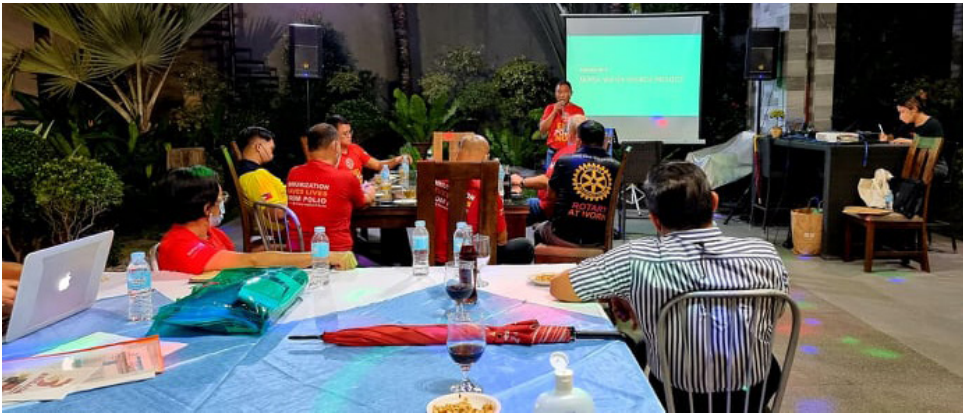
Venue: residence of IPP yelcy and pddg elmer