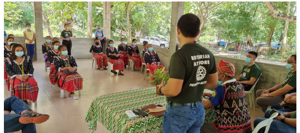
(Nopol DAM Indigenous People's Community) Purok 7, Nopol, brgy. Mabuhay, General Santos City