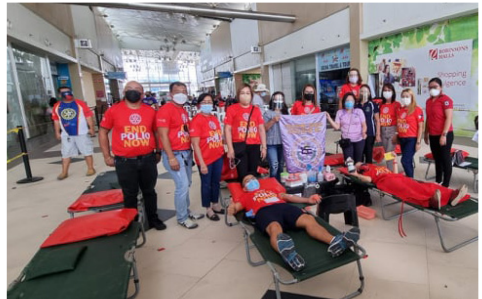
Robinson's Place Gensan