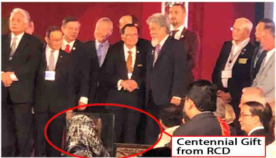
Centennial Gift from RCD