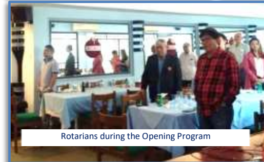
Rotarians during the Opening Program