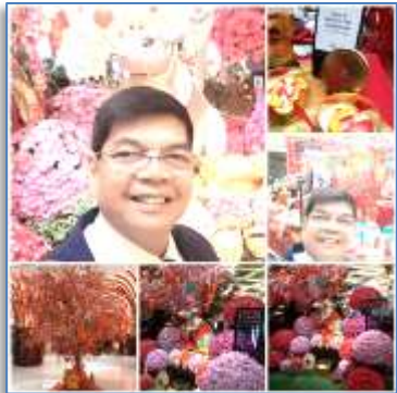
SAGREX CORP @ 40 w/ ROTARIANS... JANUARY 18, 2020 @ Waterfront Hotel Davao City