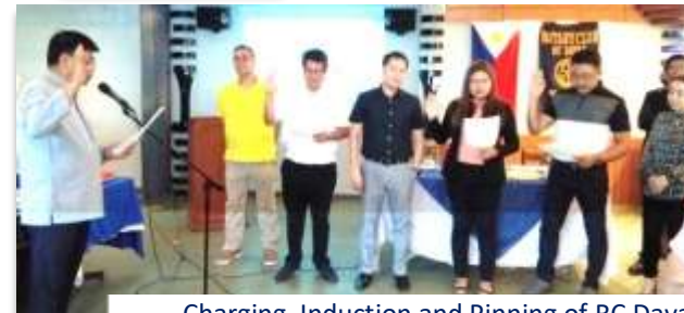
Charging, Induction and Pinning of RC Davao New Members