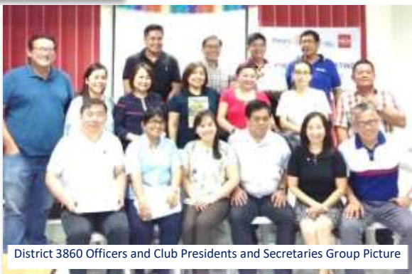
District 3860 Officers and Club Presidents and Secretaries Group Picture