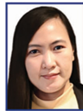
Junah Quitaban Wholesale and Retailing