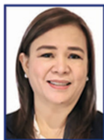
May Divino Heavy Equipment & Industrial Services