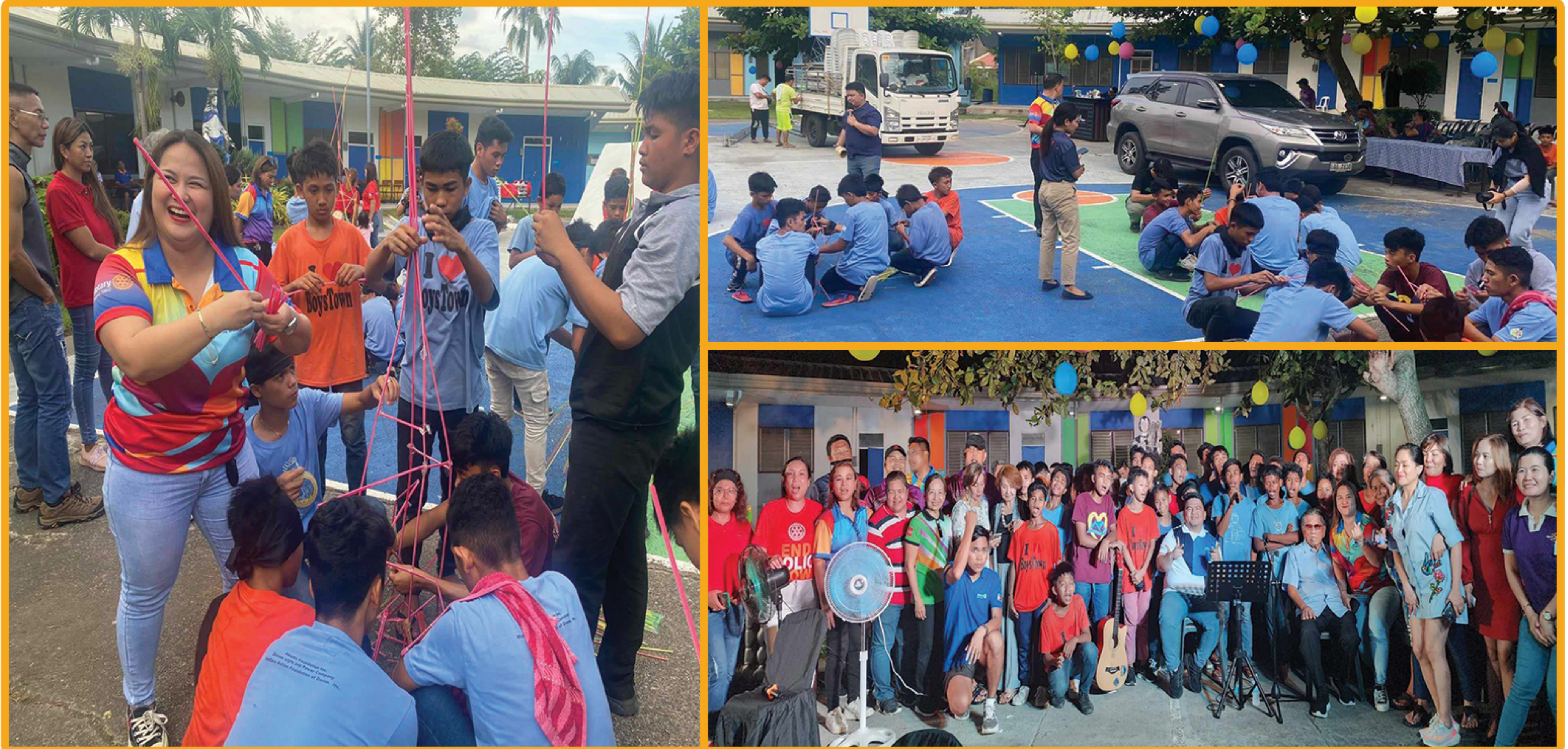
Rotary New Year Children's Party held at Boystown Maa last July 1, 2023