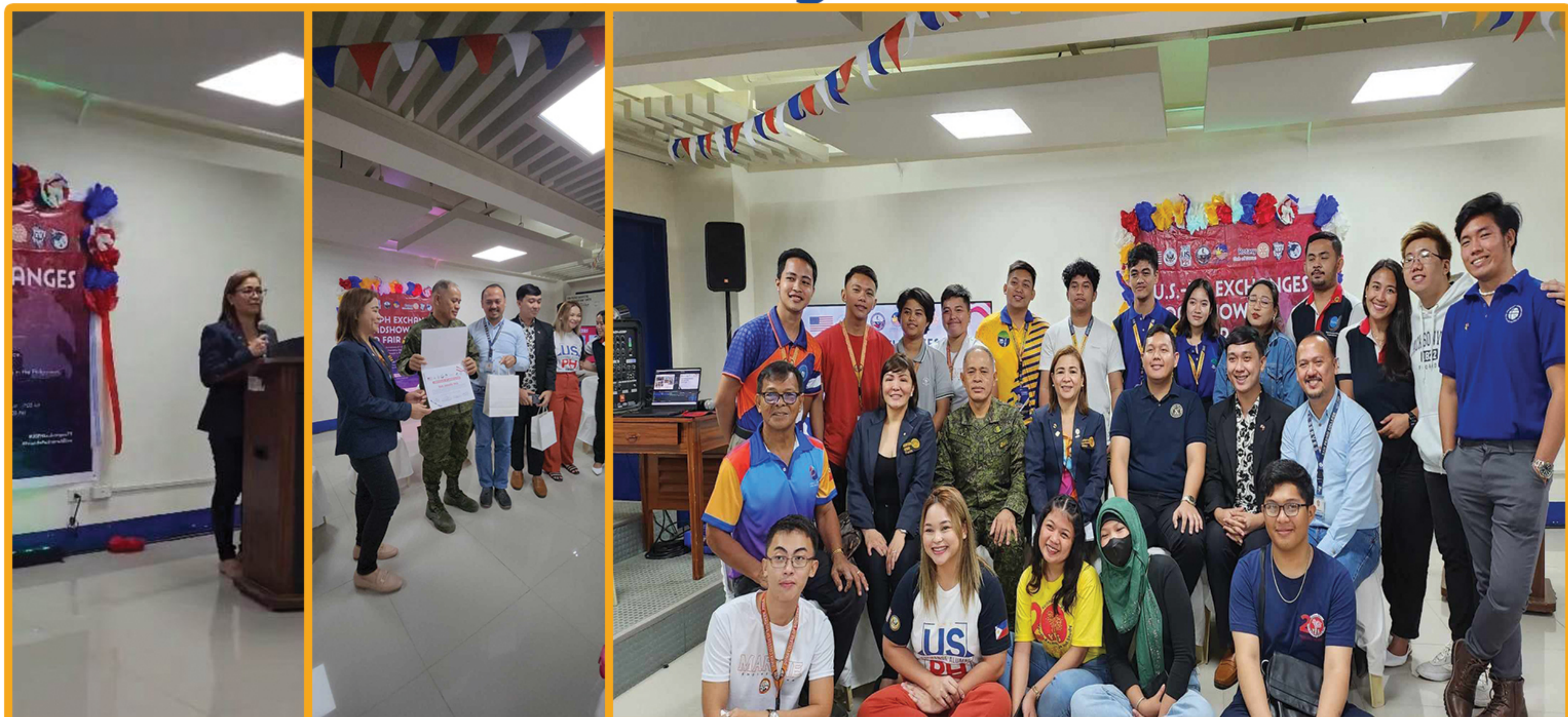
Held at San Pedro College last July 7, 2023