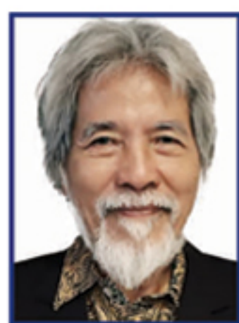
Edgar Bullecer Banana Exporting