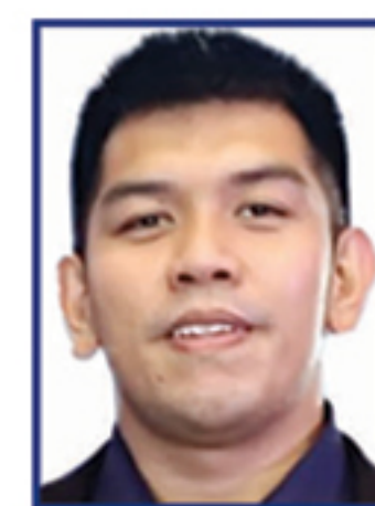
Jarlo Cataluña Pilotage Services