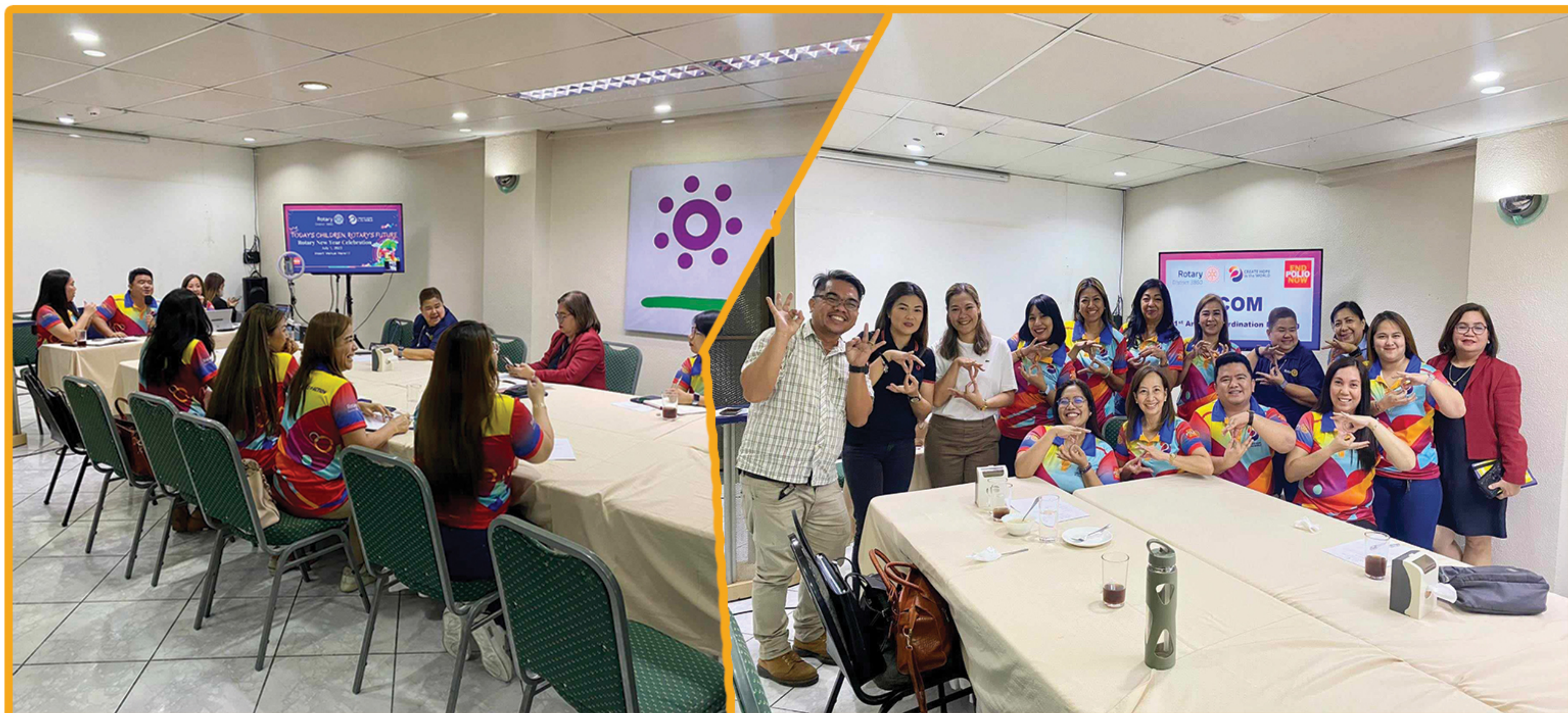
Held on June 15, 2023 at Roadway Inn