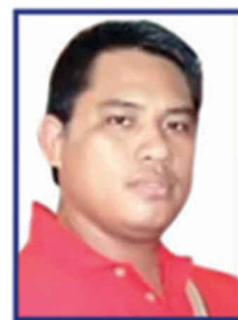
Joseph Magno Organic Fertilizer Distribution