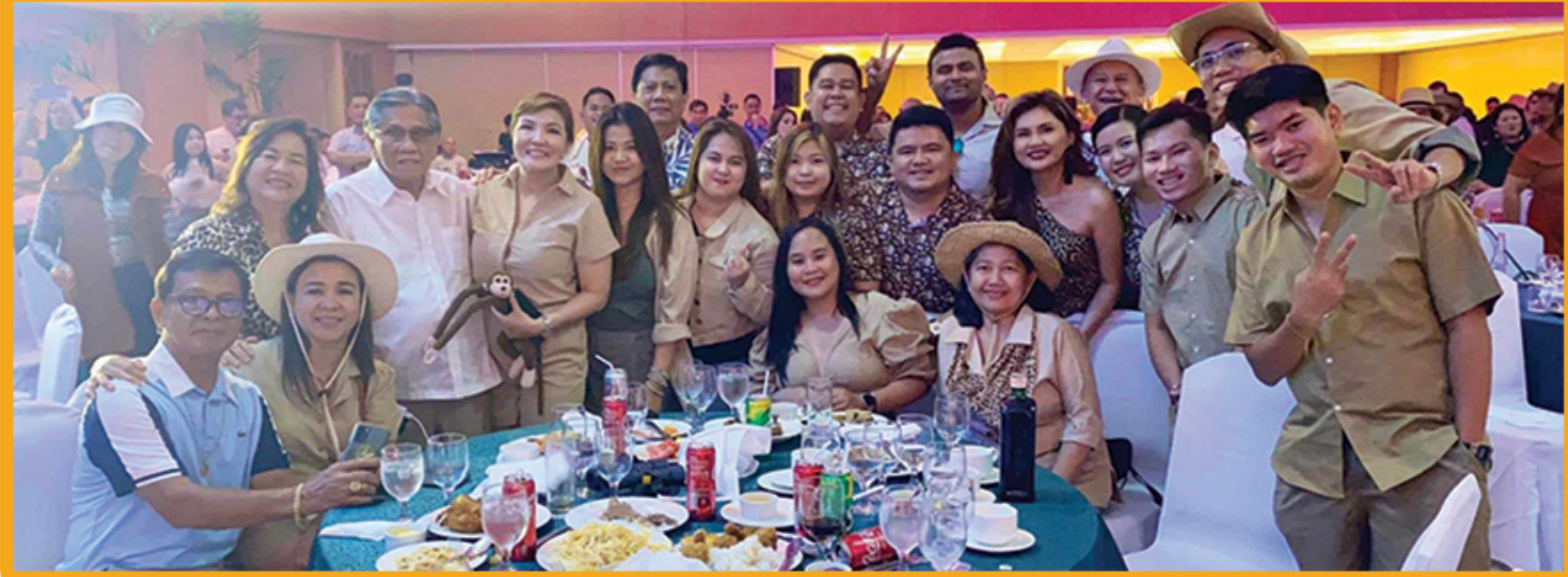
Held at Hennan Resorts, Panglao, Bohol last April 21-22 with 11 participants from RC Davao