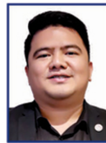
Lester Jones Suarez Vocational School Management