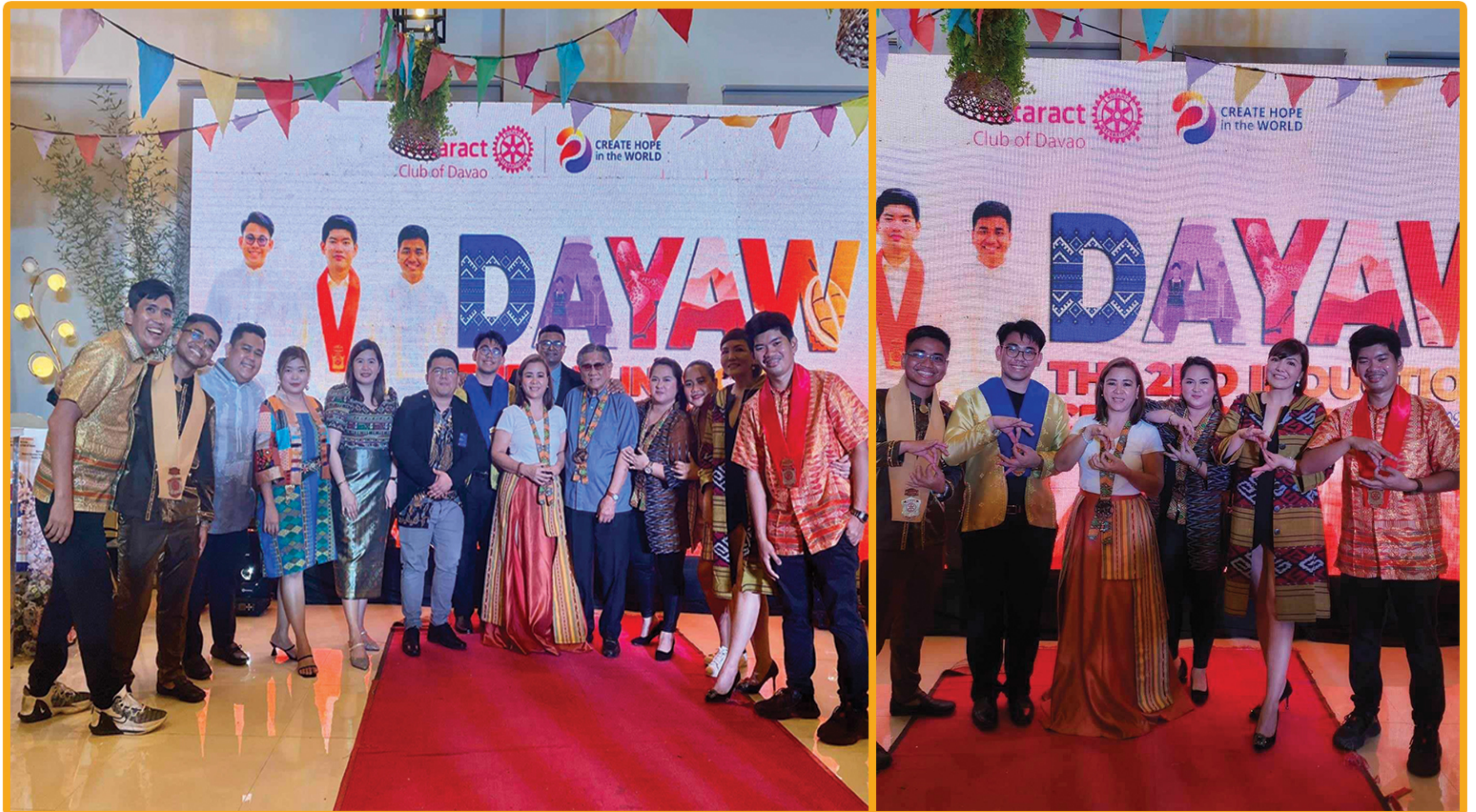
Held last July 2, 2023 at the Lyceum of the Philippines University