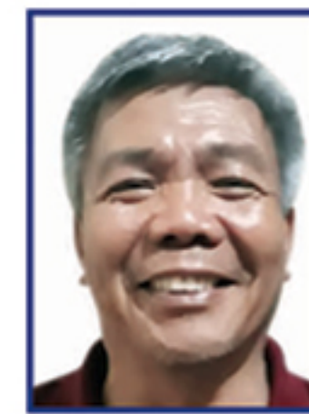
Edgar Rico Trucking Services