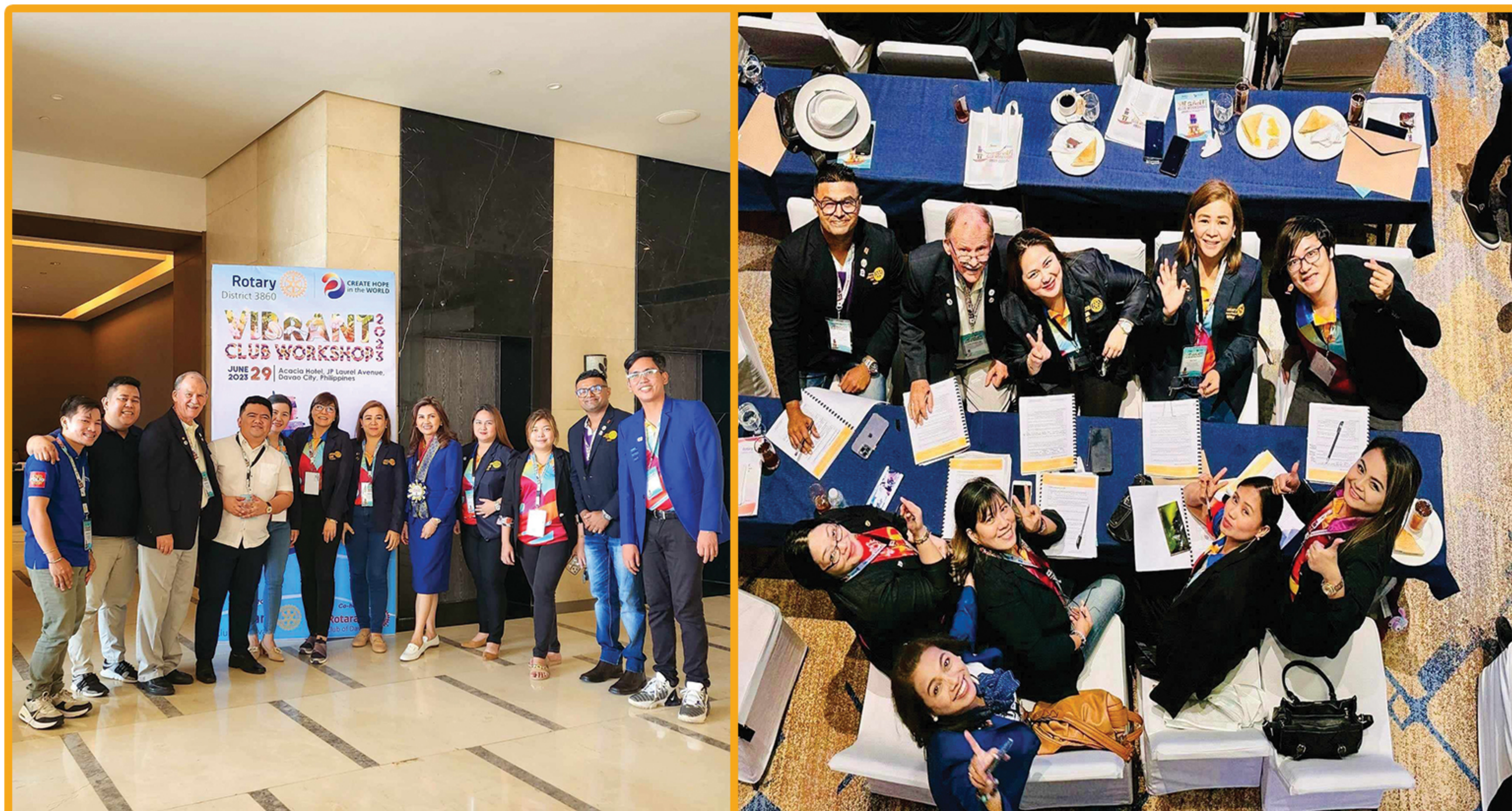
Held on June 29, 2023 at Acacia Hotel