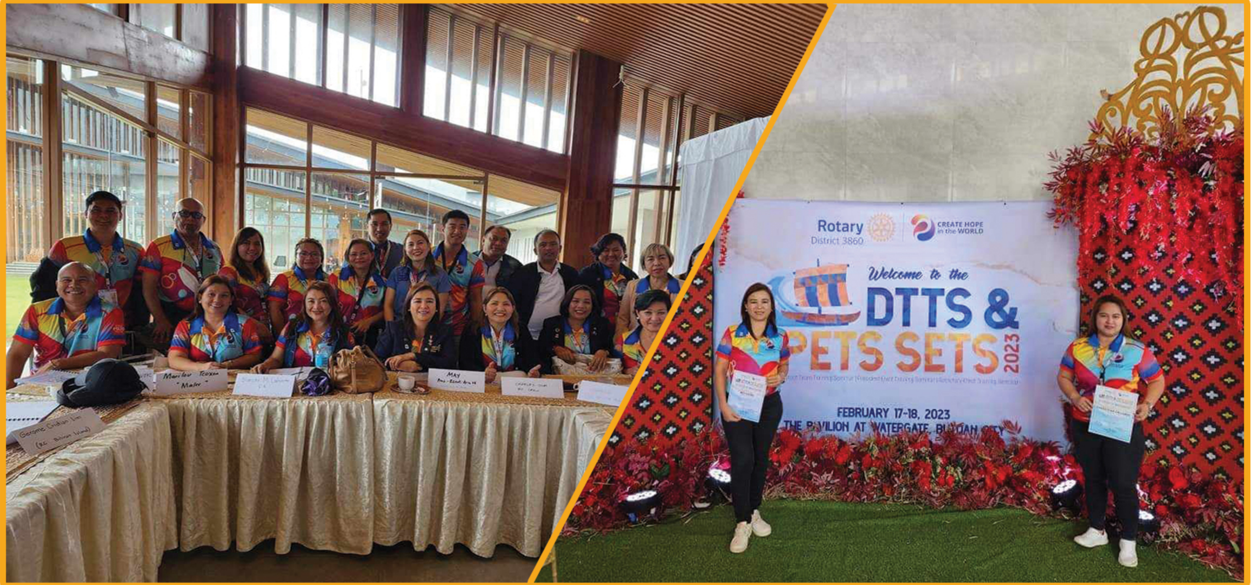
Held on Feb. 17-18, 2023 at The Pavillion at Watergate, Butuan City