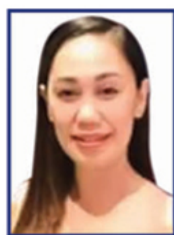
Fatima Biston Travel Agency