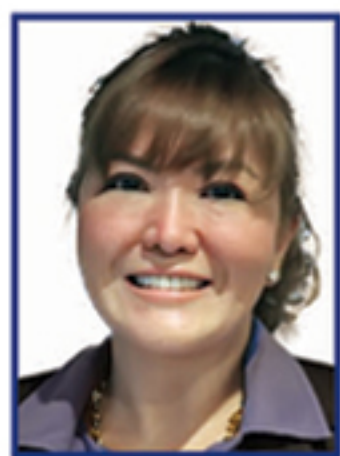
Filipina Liban Lending