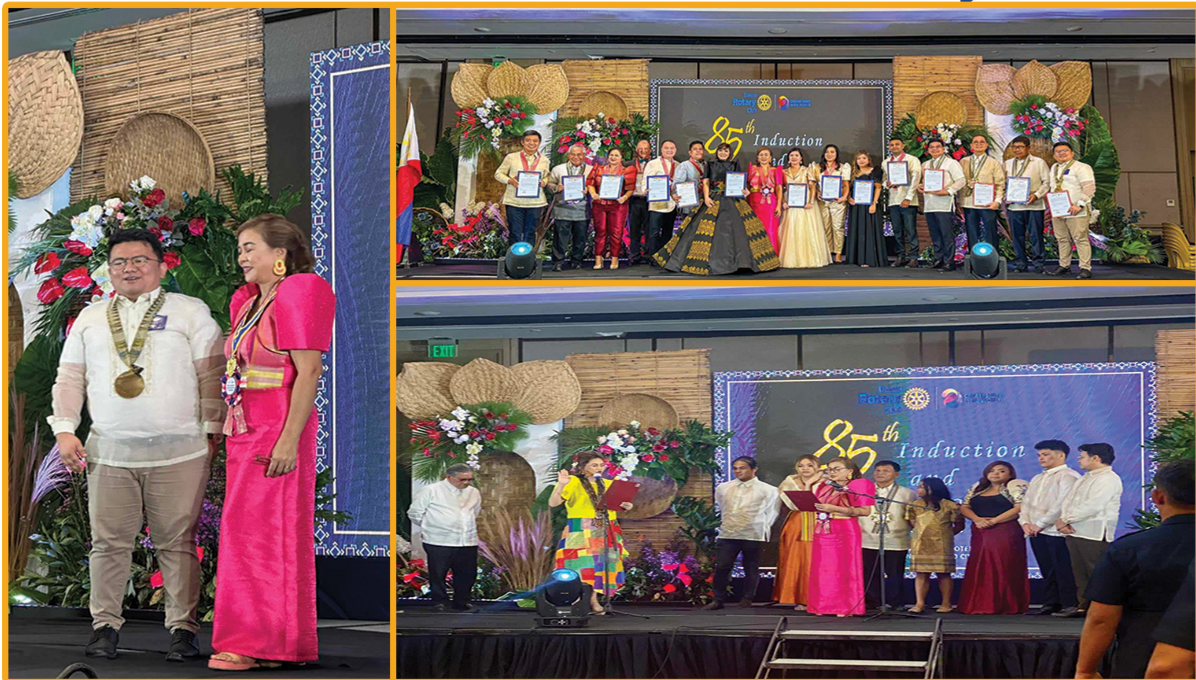
Held last July 6, 2023 at Dusit Thani Ballroom