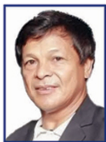
Filomeno Divino Heavy Equipment & Industrial Services