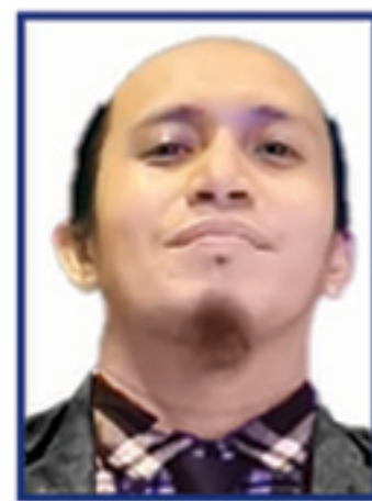
Xambrey Uy Samgyupsal Franchising