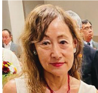
Former Japanese Consul Tomoko Dodo