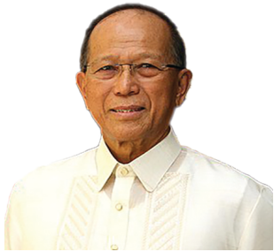
Gen. Delfin Lorenzana Former Sec. of National Defense