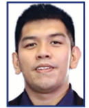
Jarlo Cataluña Pilotage Services