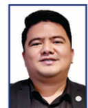
Lester Jones Suarez Vocational School Management