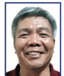
Edgar Rico Trucking Services