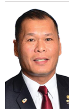
Junior Diano Advisor