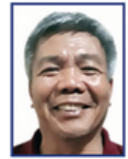
Edgar Rico Trucking Services