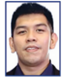
Jarlo Cataluña Pilotage Services