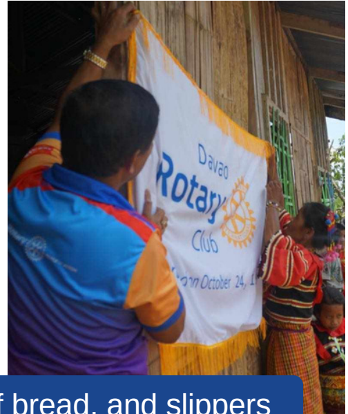
Donated school supplies, vitamins, loaves of bread, and slippers to Sitio Dulyan residents. In partnership with various clubs.