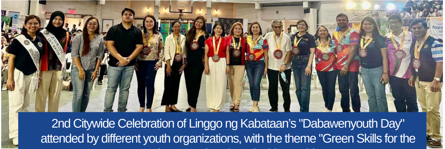
2nd Citywide Celebration of Linggo ng Kabataan's "Dabawenyouth Day" attended by different youth organizations, with the theme "Green Skills for the Youth: Towards a Sustainable World".