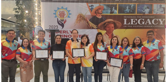
Medical Mission for Elderly Filipino in partnership with National Commission of Senior Citizens and other Rotary Clubs.