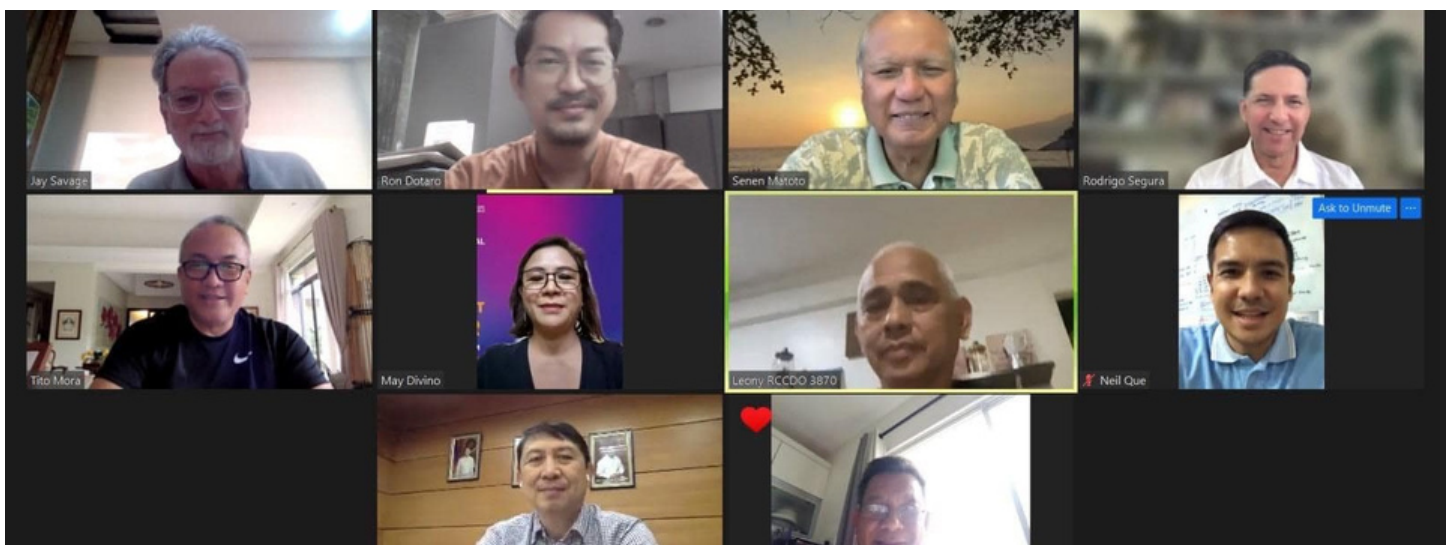
Zoom Meeting with Rotary Club of Makati for the upcoming “Books Across the Seas Project”.