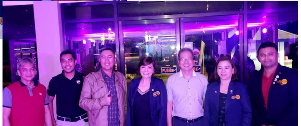
TOWEASTMIN invited Rotary Club of Davao during their fellowship night to recognize us as their partners.