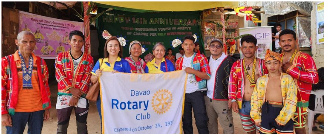
RC Davao Celebrates with the Obu Manuvu Community for their 14th Year Anniversary.