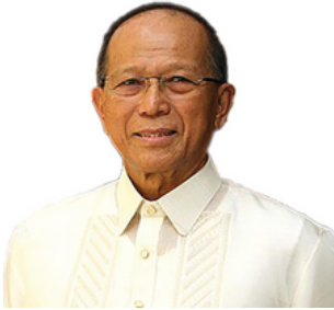
Gen. Delfin Lorenzana Former Sec. of National Defense