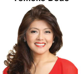
Sen. Imee Marcos