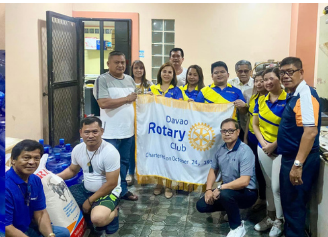
Right after the 13th luncheon meeting, Rotary Club of Davao springs into action, providing immediate relief to the flood-stricken residents of Baliok, Davao City, with essential supplies of gallons of water and sacks of rice.