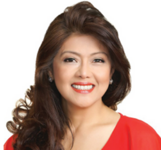
Sen. Imee Marcos