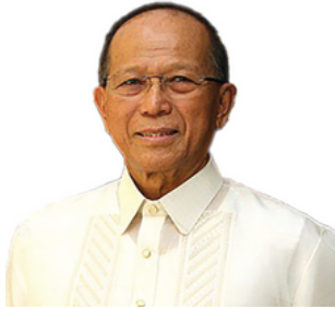
Gen. Delfin Lorenzana Former Sec. of National Defense