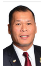
Junior Diano Advisor