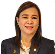
May Divino Director