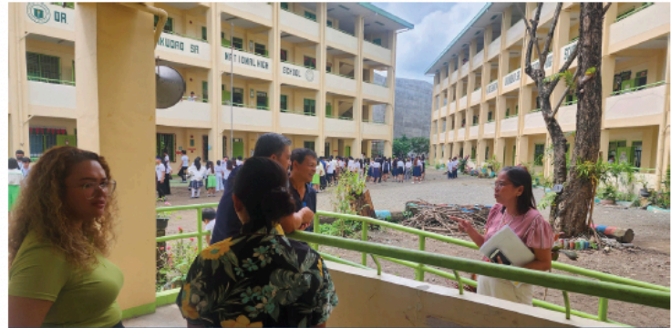
Site inspection for future project; concreting of flag raising area, to be sponsored by Rotary Club of Lahaina Hawaii

November 24, 2023 | Dr. Santiago Dakudao Sr. NHS