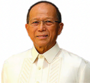
Gen. Delfin Lorenzana Former Sec. of National Defense