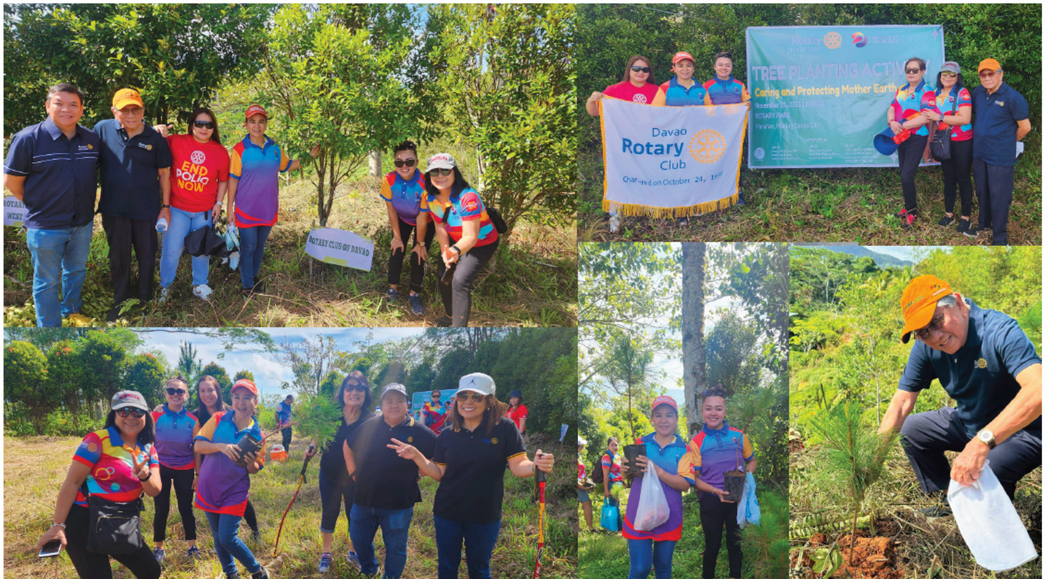
Participated in District 3860's Tree Planting Activity: Caring and Protecting Mother Earth at Marahan, Marilog