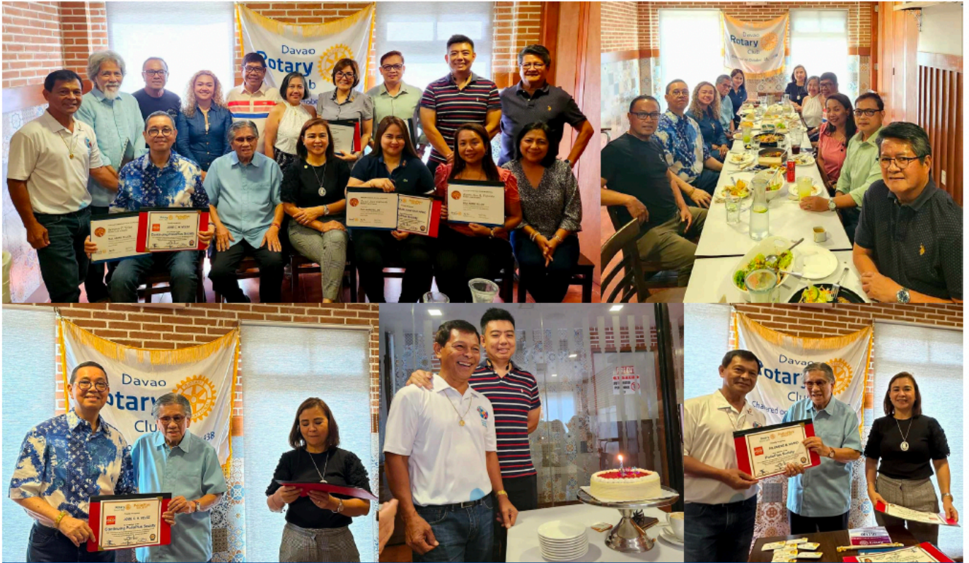
Month-end Fellowship to celebrate the birthday of the November celebrants. TRF & PolioPlus Society pins and certificates were also awarded to the corresponding Rotarians.