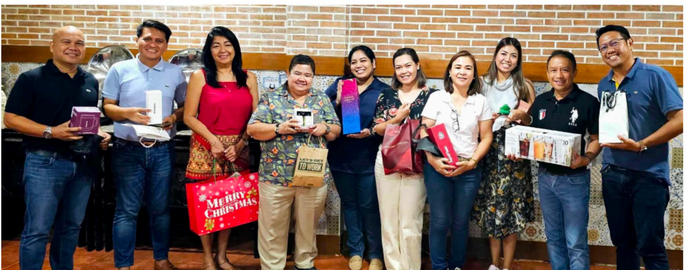
Hope Creating Team. One Goal, One Dream.