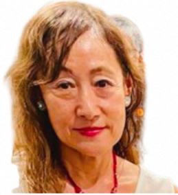
Former Japanese Consul Tomoko Dodo