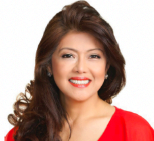
Sen. Imee Marcos