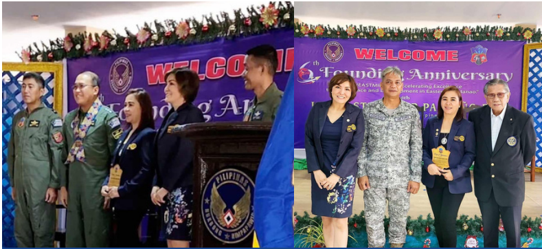
RC Davao was recognized as one of TOWEASTMIN PAF's valued partners in peacebuilding & community development

December 7, 2023 | Davao Air Station, Philippine Air Force