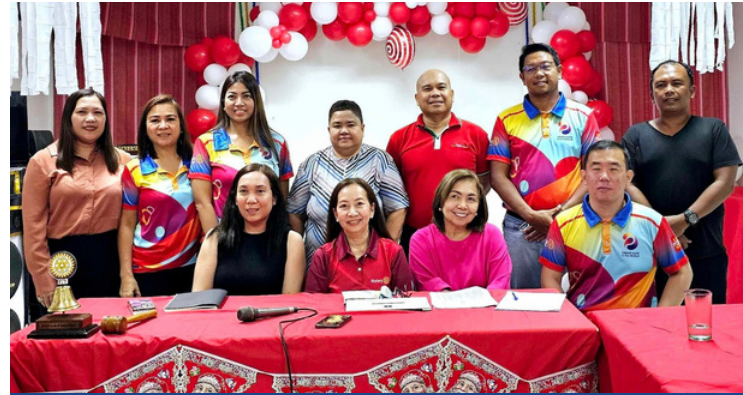
"Hope Creating" Team gathered for an Area Coordination Meeting.

December 12, 2023 | RC North Davao Clubhouse