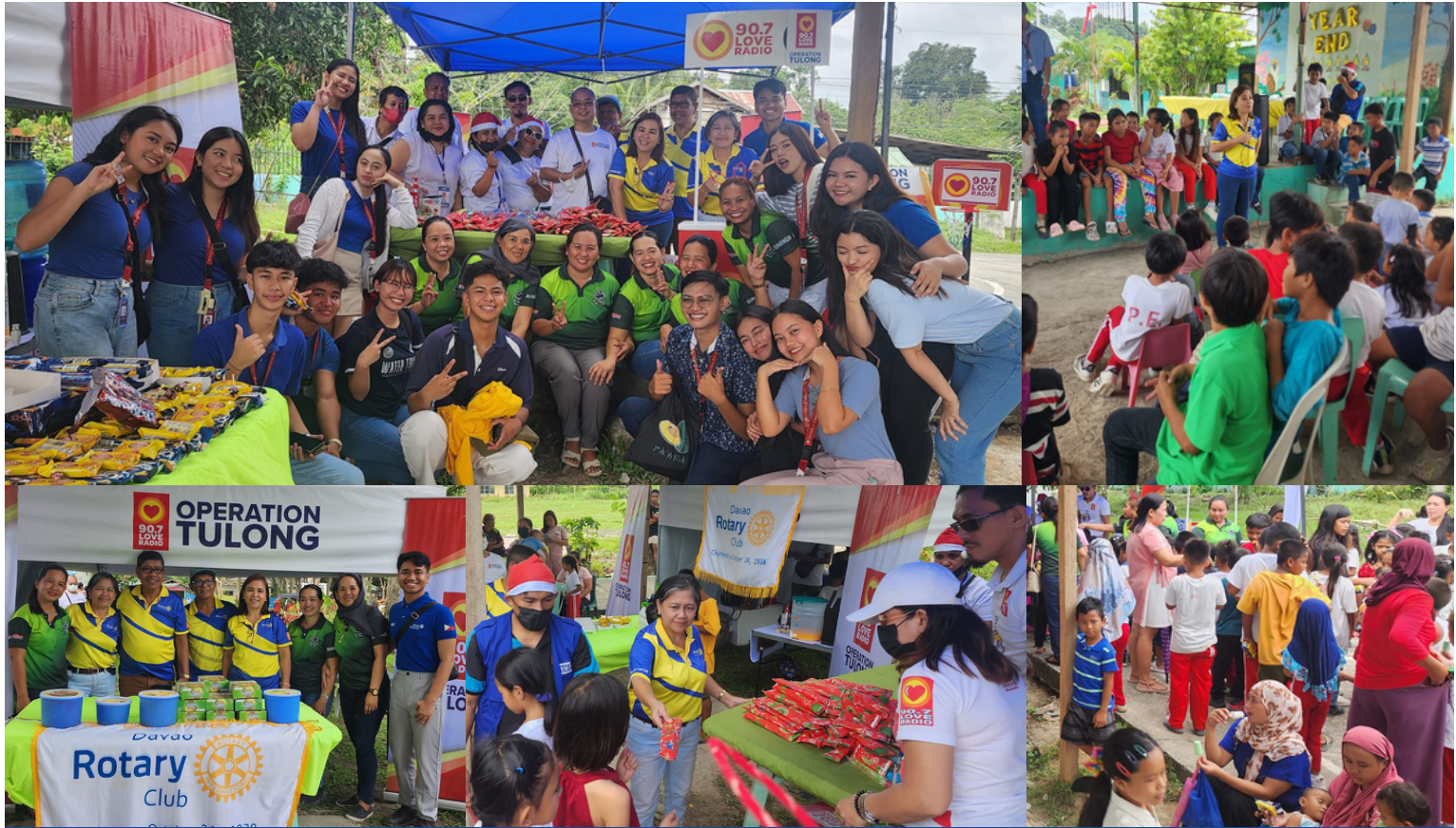
In partnership with Rotaract of Lyceum Davao and 90.7 Love Radio Davao.

December 13, 2023 | Lampa Lampidan Elementary School