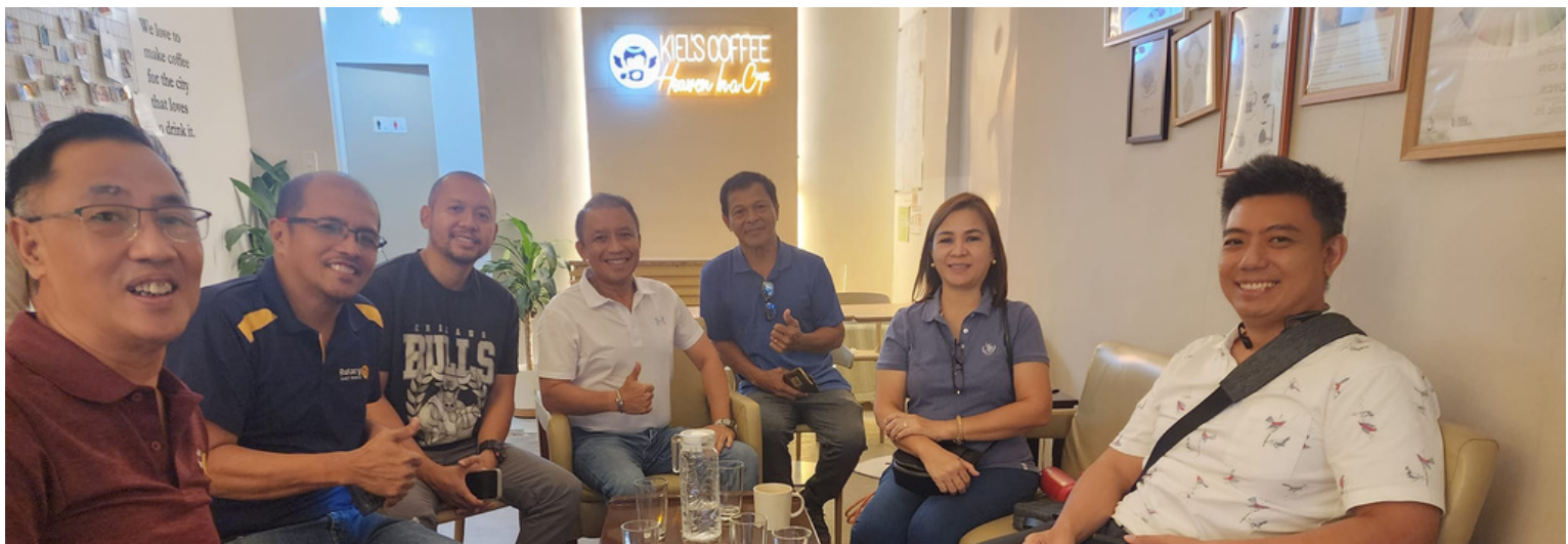
RC Davao and RC East Davao meeting for future project collaborations.