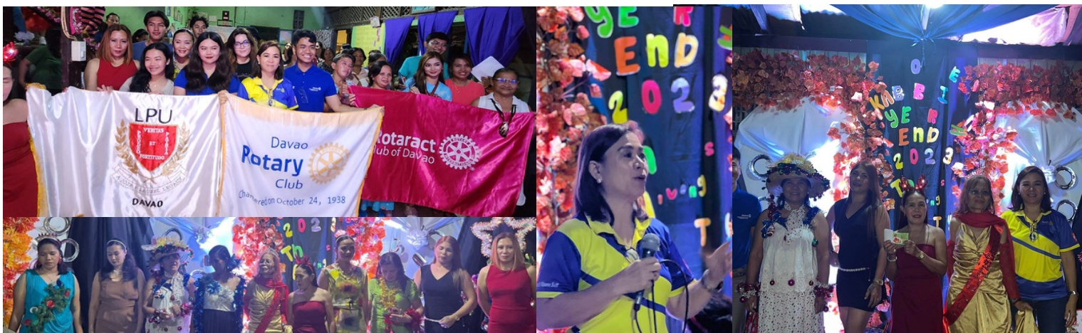
Year end party with wives of construction workers, laundry women, junkshop workers, garbage collectors, fish vendors, househelpers, jeepney and tricycle drivers.