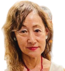
Former Japanese Consul Tomoko Dodo