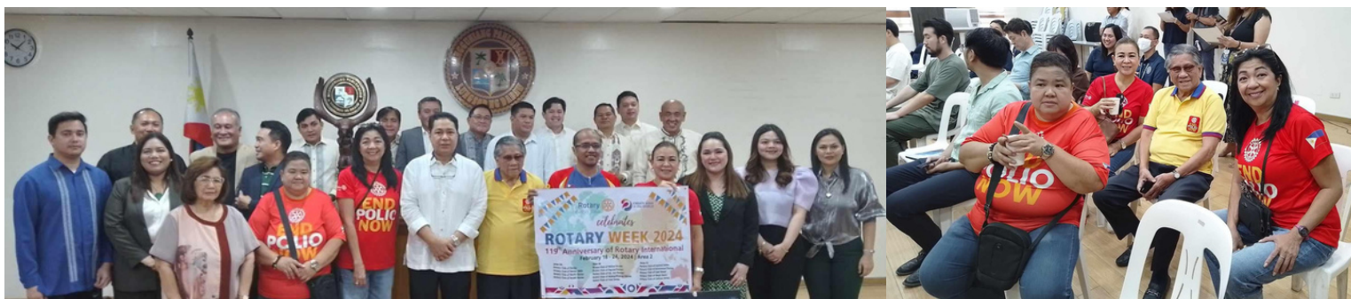
In celebration of Rotary Week, the City Council of Davao acknowledged Rotary Club District 3860 Areas 2A, 2B, & 2C for our one-week activity.