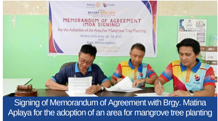
Signing of Memorandum of Agreement with Brgy. Matina Aplaya for the adoption of an area for mangrove tree planting

February 19, 2024 | Brgy. Hall, Matina Aplaya