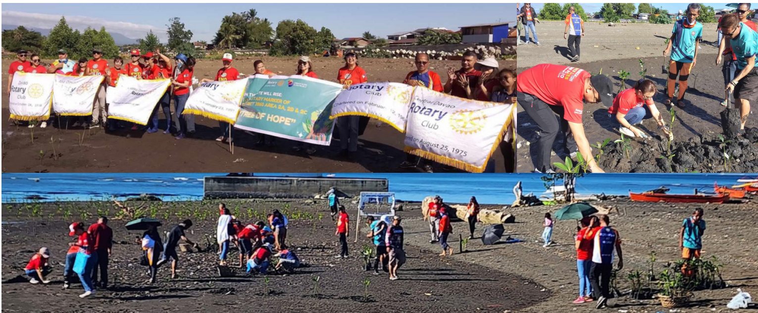
3rd day of Rotary Week: Mangrove planting in our adopted area at Brgy. Matina Aplaya.