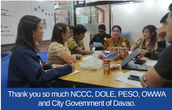
Thank you so much NCCC, DOLE, PESO, OWWA and City Government of Davao.