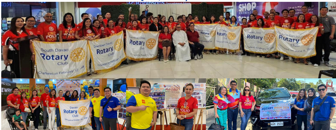
Celebrating the 119th Anniversary of Rotary International! The start of the Rotary Week has been nothing short of amazing. From the motorcade to the solemn mass and the Rotary Exhibit at Abreeza.