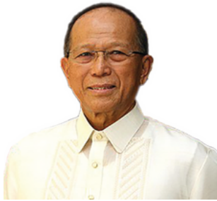
Gen. Delfin Lorenzana Former Sec. of National Defense