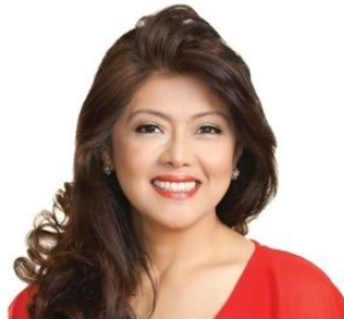
Sen. Imee Marcos