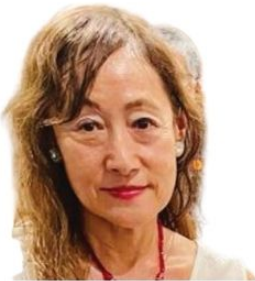
Former Japanese Consul Tomoko Dodo