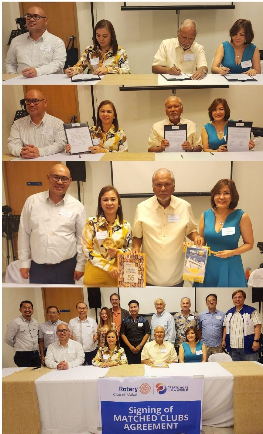
Signing of sisterhood club agreement.