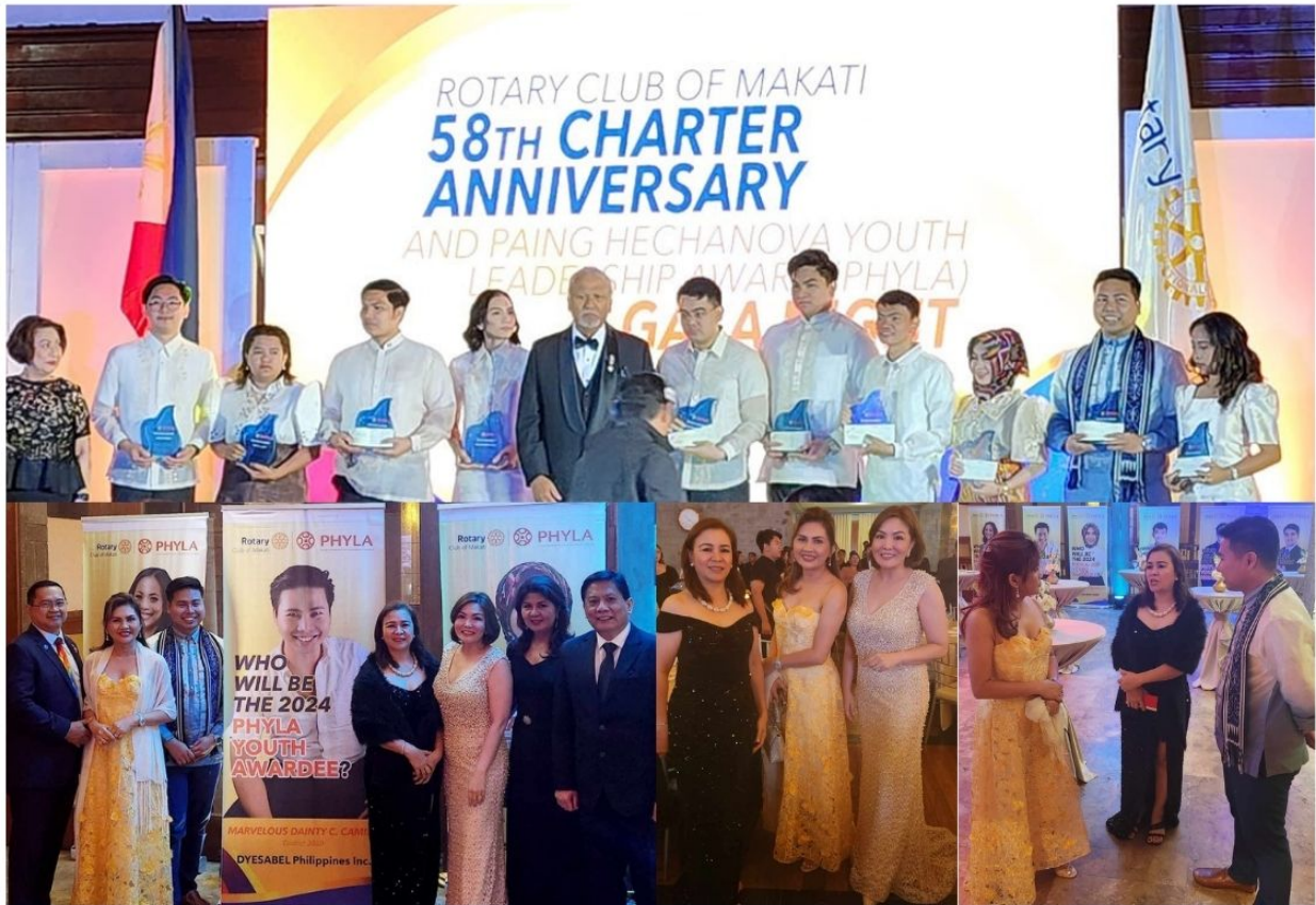
Rotary Club of Makati's 58th Charter Anniversary and Paing Hechanova Youth Leadership Award (PHYL) Gala Night