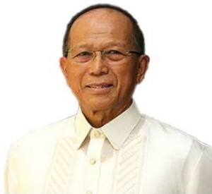
Gen. Delfin Lorenzana Former Sec. of National Defense