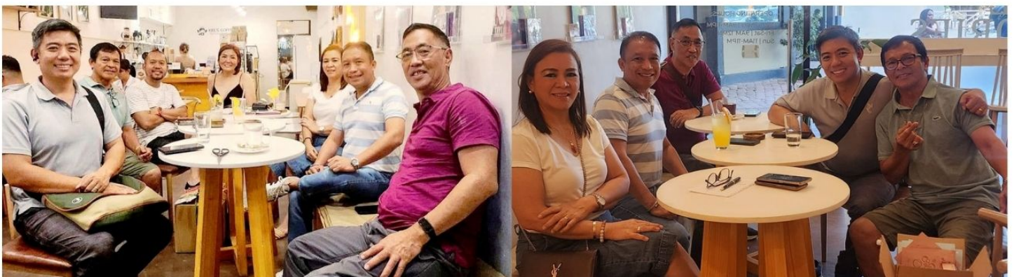
Meeting with RC South Davao for the upcoming golf tournament.