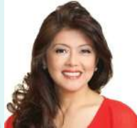
Senator Imee R. Marcos