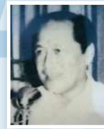
(1ST) BERNARDO CARPIO 1960-1961