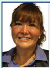
Filipina Liban Young Leaders Contact