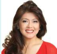
Senator Imee R. Marcos