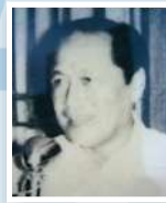
(1ST) BERNARDO CARPIO 1960-1961