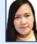
Junah Quitaban Wholesale and Retailing