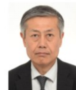
Hon. Yoshiaki Miawa Consul General of Japanese Consulate Office in Davao City