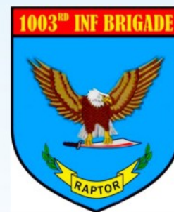
BRIGADIER GENERAL NOLASCO A. MEMPIN Commander, 1003rd Infantry (Raptor) Brigade

I NDEED, not all heroes are dead or wear capes. Some are out there in the jungle risking their lives to fight the state's enemies while some are on the streets acting as the gatekeepers to protect the people from terrorist attacks that will happen in their area.