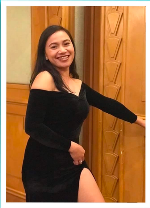
April 3 Aiza