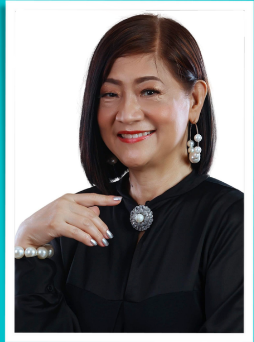
April 6 Philfa