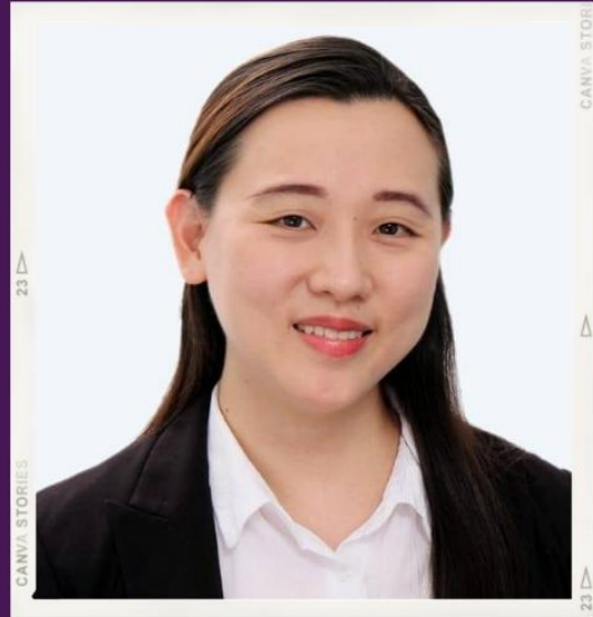
Sec. Lucy ★ September 16