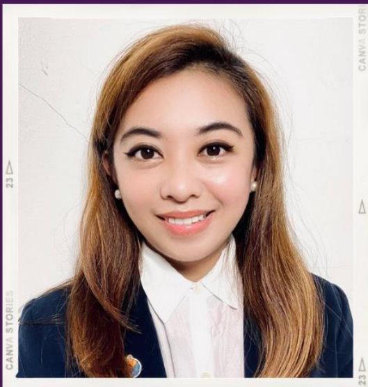
Dir. Bless September 27