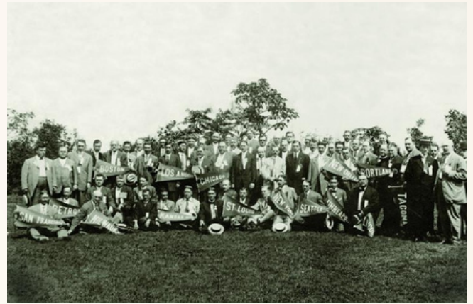
Attendees at Rotary's first convention in Chicago in 1910. Rotary's first fiscal year began the day after the convention ended.

Rotary's first fiscal year began the day after the first convention ended, on 18 August 1910. The 1911-12 fiscal year also related to the convention, beginning with the first day of the 1911 convention on 21 August.