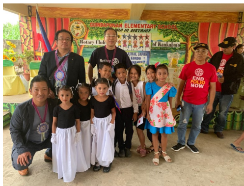
RC Fukui Ajsai had a photo opportunity with the pupils who performed during the welcome program.