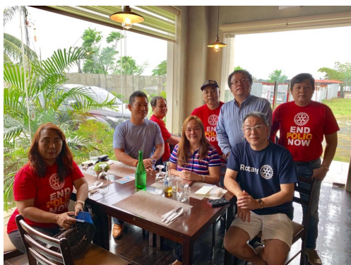
Rotarians having their lunch at Hotel Costa Brava together with RC Fukui Ajsai, Japan