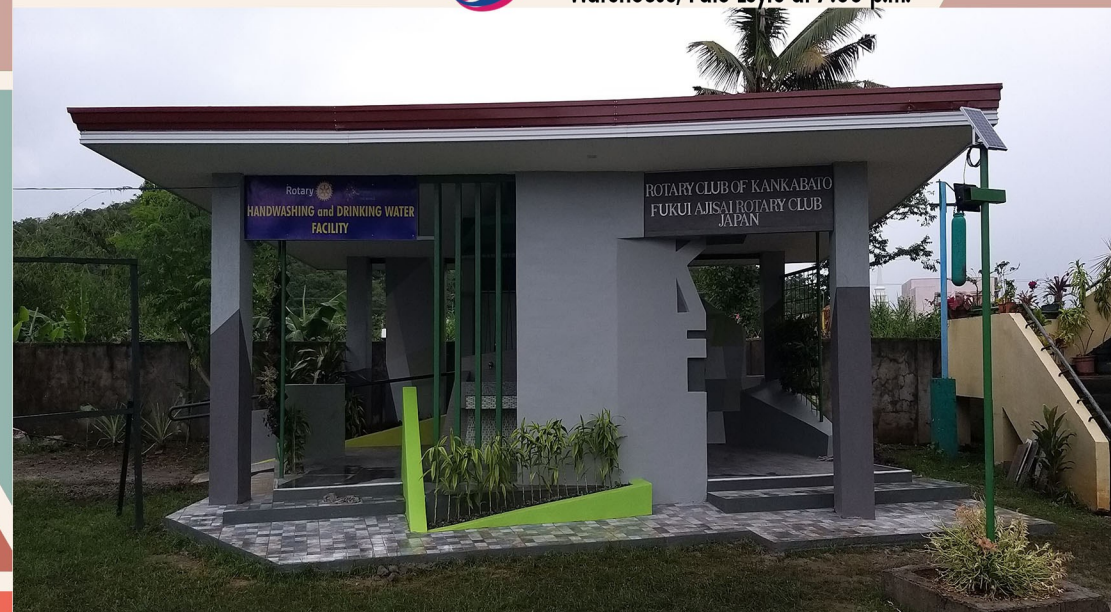
HANDWASHING AND DRINKING WATER FACILITY GUINDAPUNAN ELEMENTARY SCHOOL PALO, LEYTE

RESOURCES INC. ROVIC BLDG. JUSTICE ROMUALDEZ ST. TACLOBAN CITY