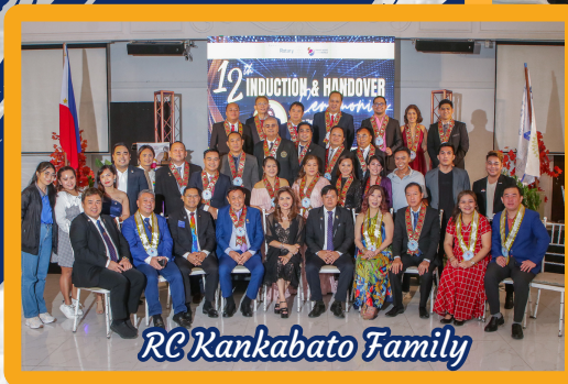
RC Kankabato Family