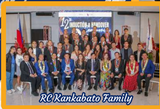
RC Kankabato Family