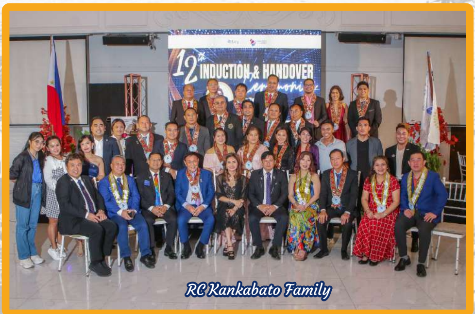
RC Kankabato Family